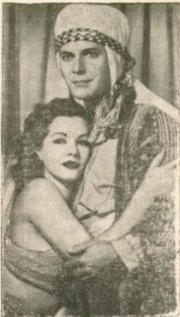
Jon Hall - Sabu - Maria Montez In ARABIAN NIGHTS

Thursday - Friday - Saturday ARABIAN NIGHTS In technicolor