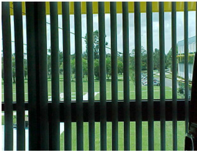
Vertical blinds in an office at FSEC

While these devices often control heat and glare they do so at the expense of visible light. The reduction in visible light reduces the overall effectiveness of the dimming ballasts. For instance, in three large commercial buildings in Canada (51° N latitude) it was found that daylighting systems functioned poorly due to the use of glazings with low visible transmittance and low interior reflectance (Love, J. A., 1995).