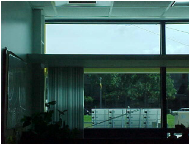
Lightshelves in the South facing windows at FSEC

While these devices often control heat and glare they do so at the expense of visible light. The reduction in visible light reduces the overall effectiveness of the dimming ballasts. For instance, in three large commercial buildings in Canada (51° N latitude) it was found that daylighting systems functioned poorly due to the use of glazings with low visible transmittance and low interior reflectance (Love, J. A., 1995).