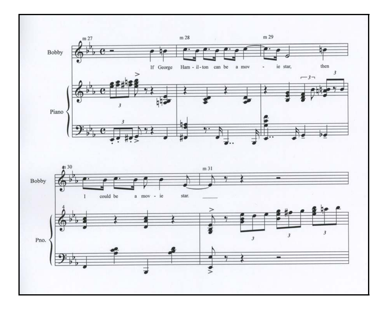
Figure 5: "Tap Dance" (Measures 27 - 31)