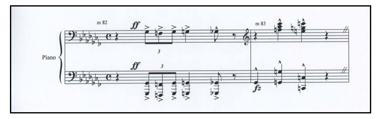
Figure 2: "I Can Do That" (Measures 82 - 83)

The closing of "I Can Do That" is a dissonant version of "shave and a haircut" from the days of Vaudeville (Figure 2).