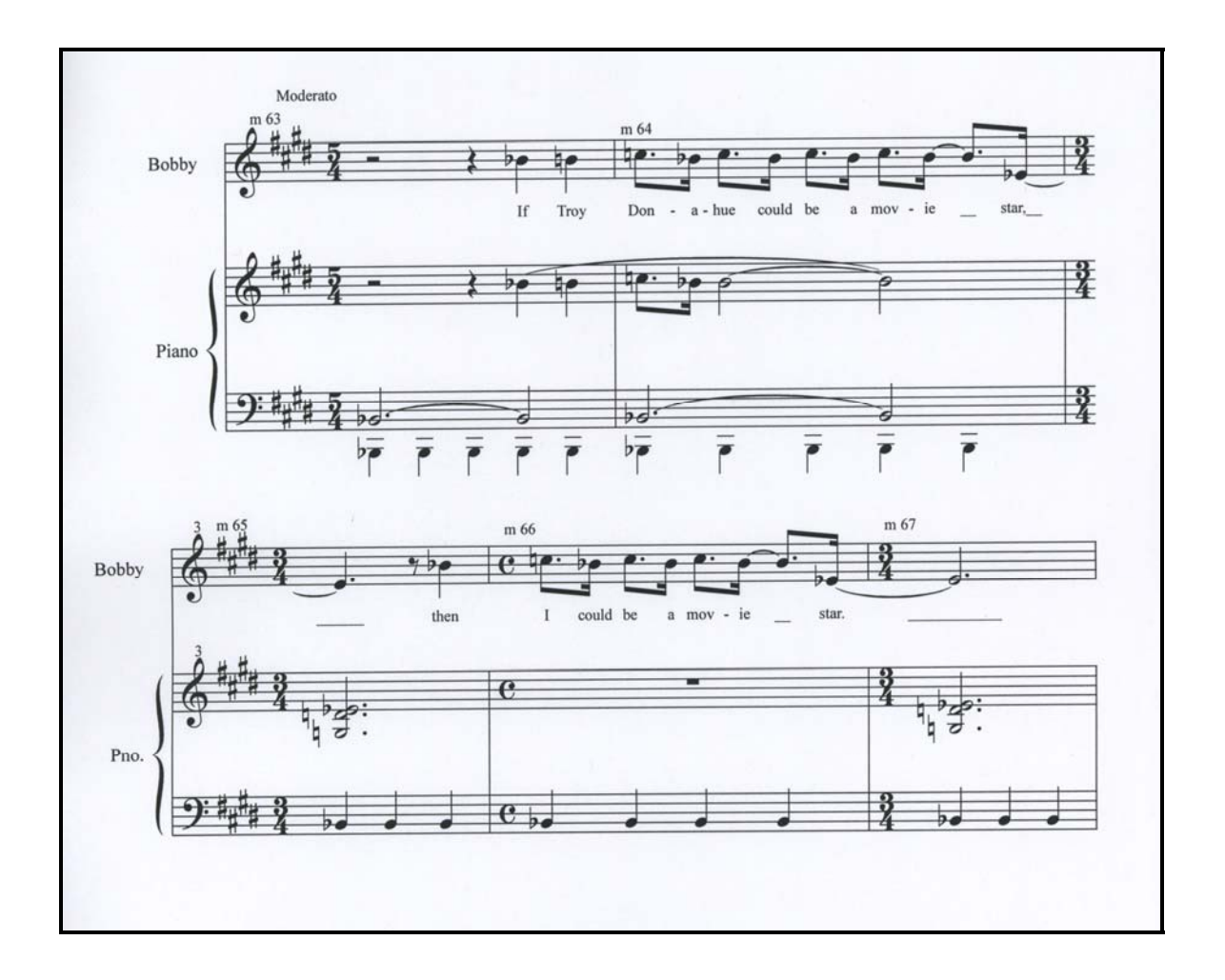
Figure 4: "Montage-Part 3: Mother" (Measures 63 - 67)

During the "Tap Dance" (Figure 5), Hamlisch accomplishes the same melodic idea written in the previous examples while stating his idea in a different style. This song is soft shoe tapping which accentuates a "boom-chunk" style in the accompaniment. Still he writes in the key of E flat, keeping it consistent with Bobby's previous two solo lines, and again employs seventh chords through out the passage, ending on an embellished I chord.