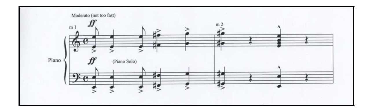
Figure 1: "Opening: I Hope I Get It" (Introduction)

The closing of "I Can Do That" is a dissonant version of "shave and a haircut" from the days of Vaudeville (Figure 2).