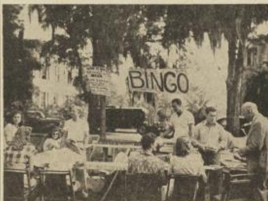
X CLUBBERS LURE VICTIMS TO THEIR BINGO CONCESSION

The event, which began three weeks ago, had thirty-four couples at the start. A prize is being offered to the winning players.