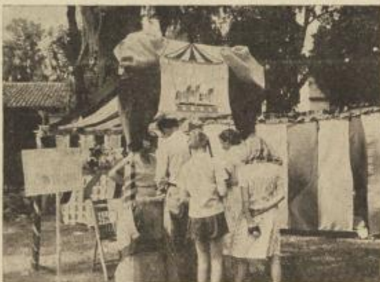
ALPHA PHI CIRCLE GAME ATTRACTS CURIOUS SPECTATORS