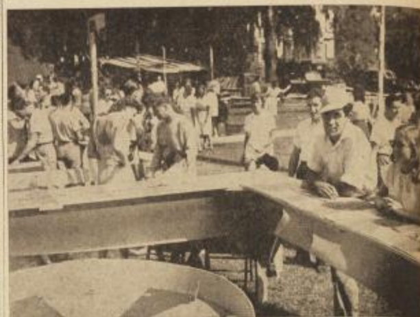
INDEPENDENT RAT RACE DRAWS LARGE CROWDS