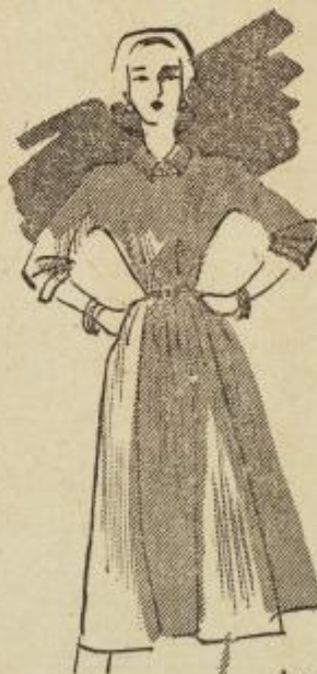
A smart corduroy in green and red from Jamison, 25.95

. . . See all the new and lovely dresses in our Fall collection . . . and at prices so low they will amaze you . . . Our dresses are priced from . . . 17.95