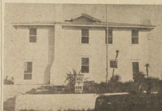
SIDE VIEW OF THE NEW PELICAN