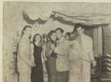
It looks like the music was sweet and too when the Kappa Kappa Gamma's pledge threw a party for incoming visitors in a cozy, decorated Pantry last Monday night.

The chapter staff sponsored big plate lightening in week-end days for the Chapel Food. Delighted with an eye toward making the work a pleasure as well as profitable occasion, the staff has planned some interesting parties for the student body.