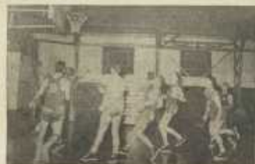
The boys are shown here preparing to get ready to make play in this penultimate game with boys of Daytona.