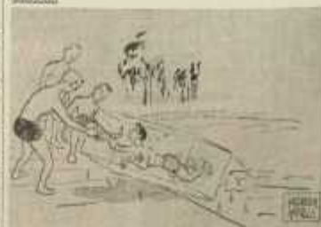
Fishes last week of fishing "on" course the water left tall.

are going to run a "fishing club" as well in which any and all aspects of fishing will be taught. Great openings will be featured on members of the club, including early season sea "hot fishing, deep sea fishing, rock water open fishing, construction of rods and reels, etc., etc." It is well to get out that the people forming this organization are experts in their field and are ready and willing to make their knowledge and experience available to interested persons.