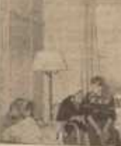
Students enter the newly decorated canteen at the Rollins which will be a storage house for extra furniture. In the back hall, where the canteen is, students are seen, entertained the staff members.