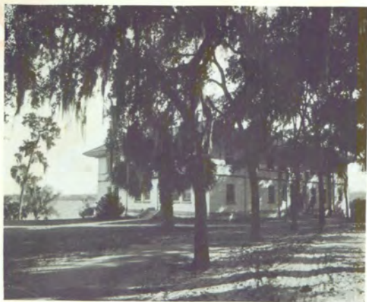
CHASE HALL, ROLLINS COLLEGE