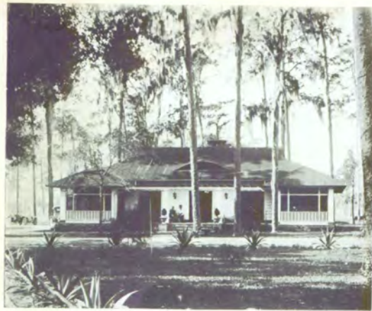
WINTER PARK COUNTRY CLUB HOUSE

gorgeous and colorful flowers, plants and shrubs indigenous to this region.