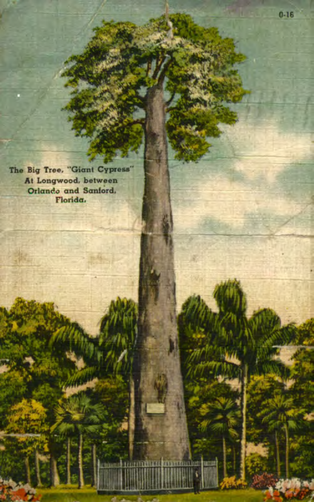
The Big Tree, "Giant Cypress" At Longwood, between Orlando and Sanford, Florida.