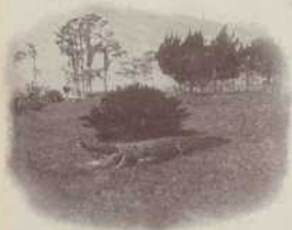
Watching for 'gators