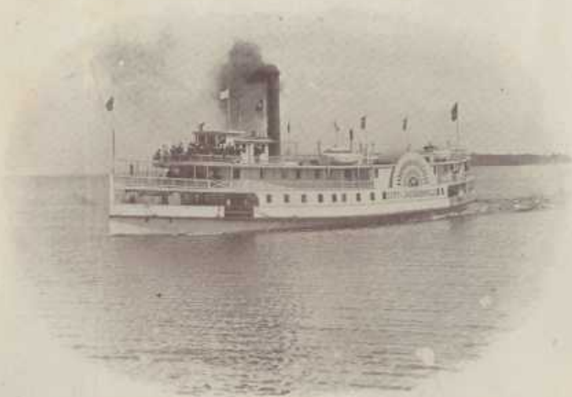
CLYDE LINE STEAMER "CITY OF JACKSONVILLE" ON THE WAY TO SANFORD.