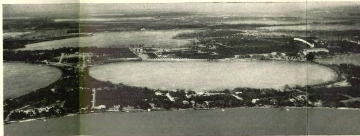
THE FLORENCE VILLA ON SPRING LAKE

The Florence Villa Social Events and Entertainments, aside from afternoon and evening concert programs, will include dinner dances weekly, on Saturday evening; bridge parties, two evenings each week; and varied other entertainments.