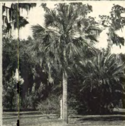
THE FLORENCE VILLA NESTLES AMONG THE PINES AND PALMS WITH GREEN SLOPING LAWNS EXTENDING TO THE LAKE SHORE

UPON YOUR FIRST VISIT, you will be impressed by the attractive plantings and rows of fruit-laden orange trees bordering the driveway and the expanse of velvet green tree-planted lawns, sloping southward to the lake shores and boat pavilion. Here, on lawns of the Lake Shore, one may bask in the sunshine or rest in the protecting shade of spreading oaks, of pines and palms, and at evening watch the dancing waters of a moonlit lake.