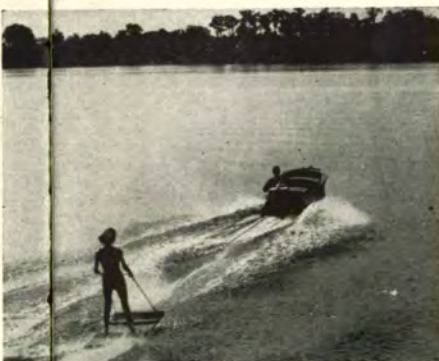
Bathing and Water Sports in City limits. There are well-equipped bathing beaches.