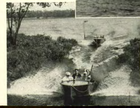
Pleasure craft and the lagoon boats accommodating guests on lake cruises make scheduled stops at The Florence Villa boat pavilion.