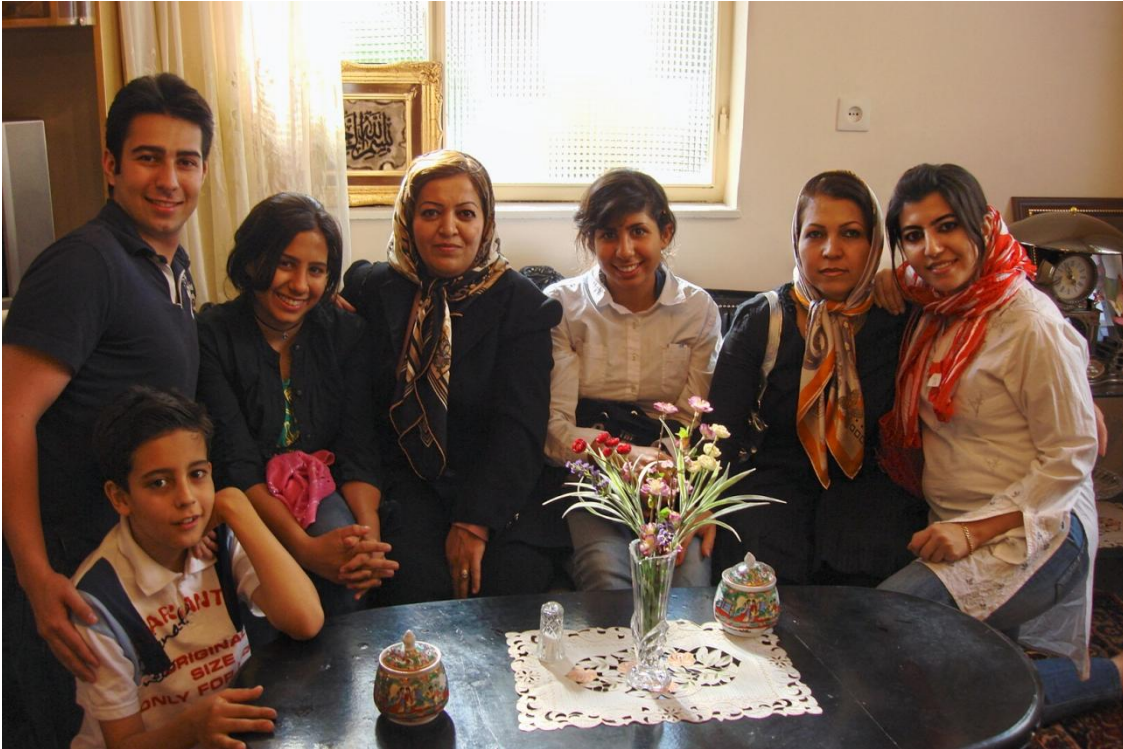
Photo 1: 2007 photograph taken of me and my family in Tabriz, Iran. Notice the colorful scarves and application of makeup.

Wearing tight clothes, colorful scarves, and makeup is not just an effort to be trendy. It is our way of expressing our frustration with a regime that refuses to grant its citizens an option of choice. In a 2007 enforcement campaign, Iranian women actually resisted the orders of moral police. 162 Yelling back at them they were both frustrated and angry—but above all they were defiant. Fashion in Iran is a perfect example of the personal being political. These women want to express who they are through fashion, and in a country with strict censorship like Iran, doing so is an act of political activism. And as restrictions increase, more and more women will turn to feminist ideals to help those resist the government’s efforts to halt change. 163