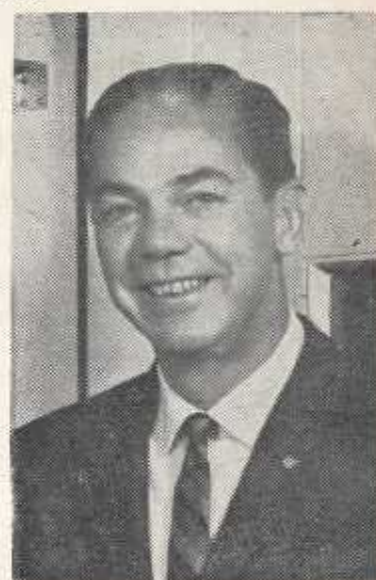
Gov. Haydon Burns

The Centennial Commission is an organization of friends of the college working with the trustees and administration on the $25 million development program which Rollins plans to complete prior to its 100th anniversary in 1985.