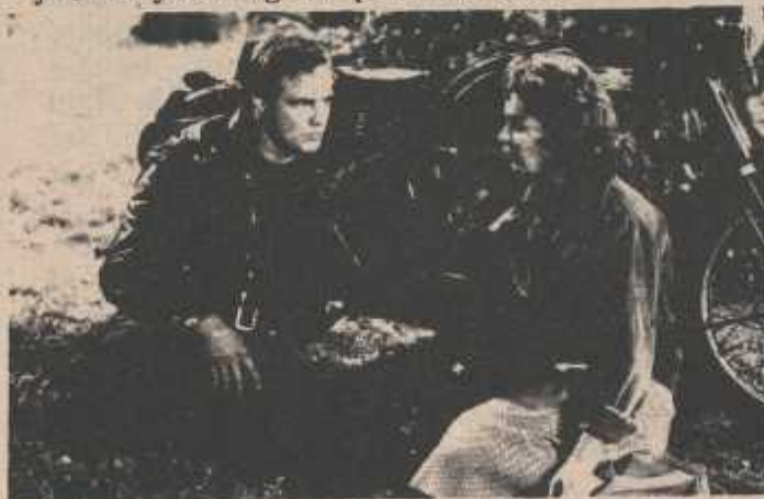
"The Wild One."

The film "East of Eden" will be shown Tuesday, October 21 at 8 p.m. in Bush Auditorium. Starring (get this you 50's freaks) James Dean, Julie Harris, Raymond Massey, Burl Ives, the film features an Academy Award winning performance by Jo Van Fleet. This adaptation of John Steinbeck's novel takes place on the Monterey Peninsula during the World War I era, and contains "violent action and tense drama in this story of family conflict and a youth's yearning for parental love."