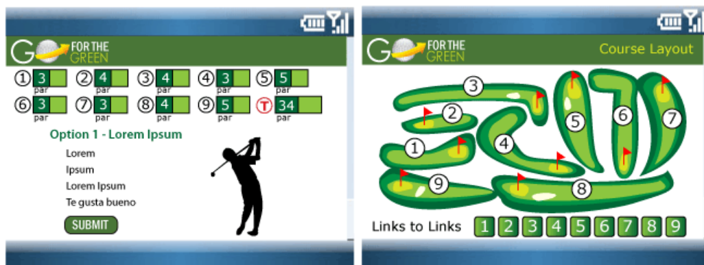
Figure 4- Go for the Green

Go for the Green is a mobile web game, developed for The Willis Organization , that uses a golf theme to reinforce key sales concepts. Nine holes of the golf course are mapped to nine steps in the sales process, with each hole presenting several questions and feedback items related to that particular step. Users attempt to complete the full course by answering all questions and avoiding common "traps" in the sales process. By using streamlined mobile web development rather than creating a specific game application, we are able to deliver this content to a wide range of user devices including iPhone, Blackberry and various Symbian and Windows Mobile platforms.