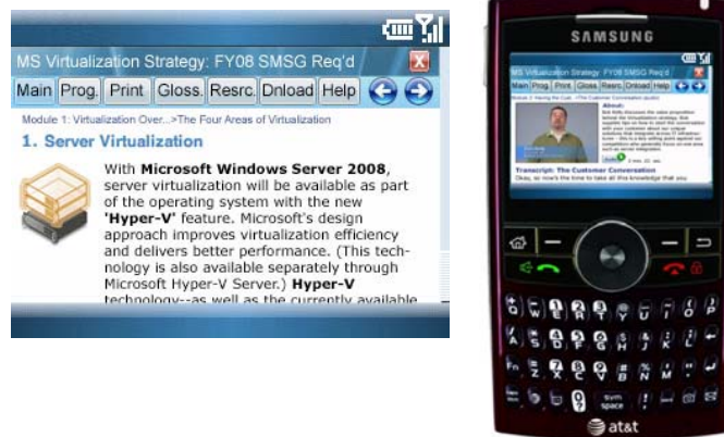
Figure 2- Microsoft Mobile Course and IVR Sales Materials Project

Sales professionals in particular have a strong need for on-demand, mobile access to refresher materials on their product line. Driving, however, provides challenges to many methods of delivering mobile content, such as apps or mobile web access, due to limiting ability to look at the device's screen; this is especially true now due to stricter hands-free laws in many states. In order to allow simple, hands-free access to sales data, we developed a voice recognition IVR (Interactive Voice Response) system that allows sales professionals to navigate Microsoft's product information library and select audio for listening.