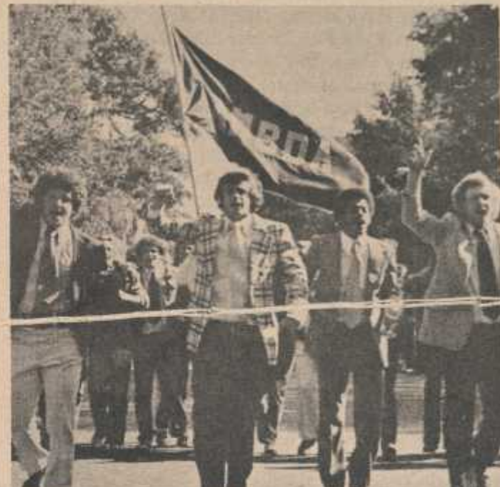
Lambda marches down Holt after a successful pledgship.

Take a look at the pictures and judge for yourself. There is a good chance that this mob behavior will not be around again until next year.