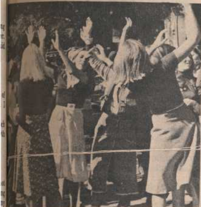
NCM gals Flame on!