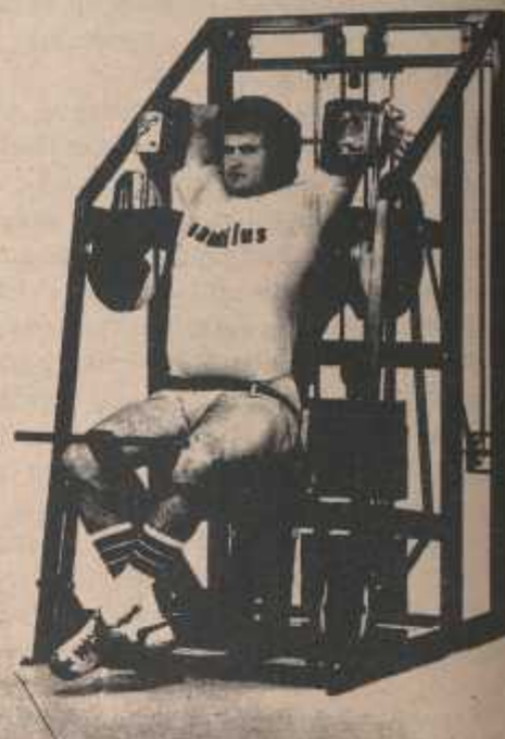
Pullover Torso Machine