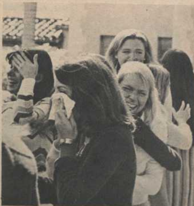
Happiness abounds as Kappas receive new pledges.