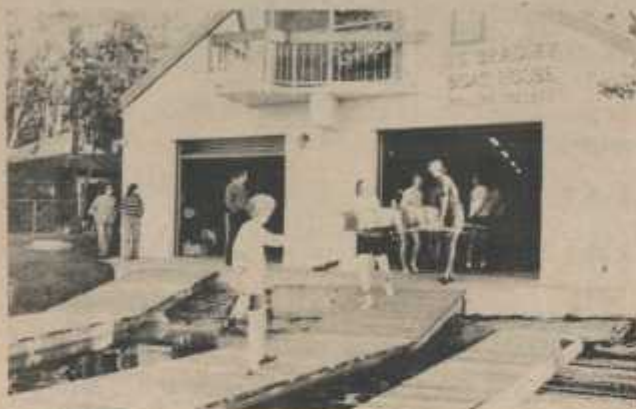
Crew members prepare the boat for practice.