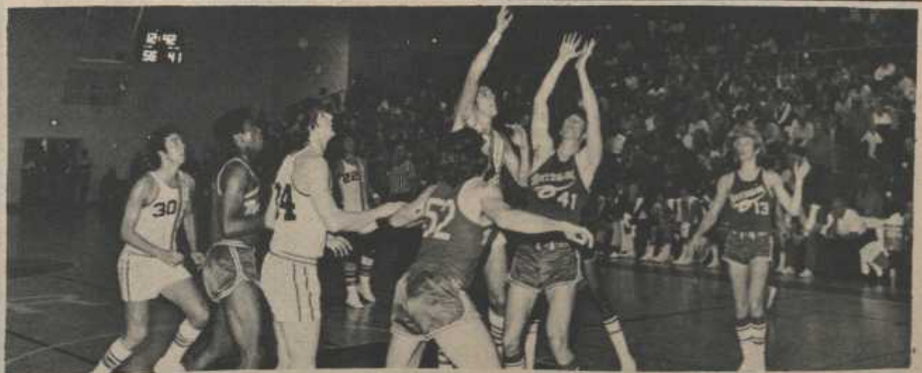
Rollins vs. Florida Southern