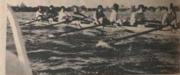
Cold weather doesn't detain the Crew team from practice.