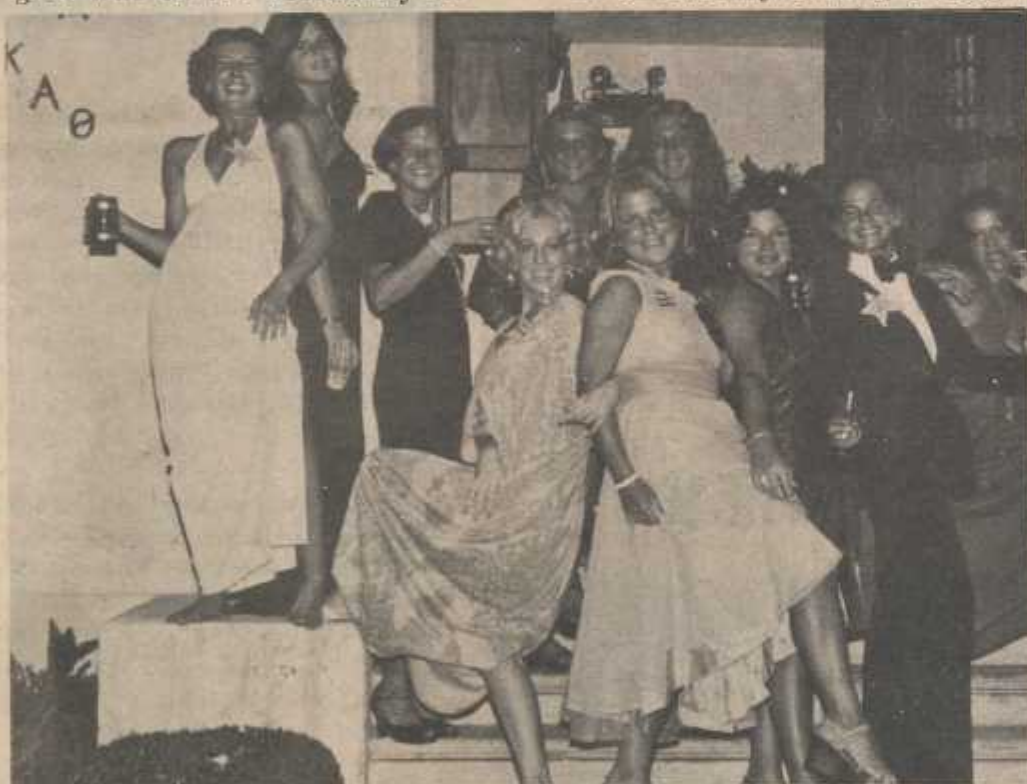
Theta's take pride in how they dress for rush parties.

The evening was topped with an after-party at the Lambda house, where those who had attended the rush party were joined by other Rollins students. The party mood continued long after the beer ran out, as students were seen dragging themselves home long into the morning hours.