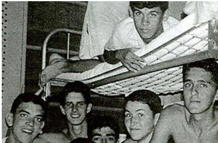
Figure 2: Random Operation Pedro Pan children. From Time Magazine.

Since Castro's takeover in 1959, the United States and Cuba have had disagreements regarding Castro's government choices. Some of these problems have led to mass migration from Cuba to the United States. On August 28, 1960, the United States imposed its first embargo on trade with Cuba. This embargo was put in place to weaken Cuba's economy and government. When the United States established the embargo, Fidel Castro made connections with the Soviet Union and began to trade with them. Unfortunately for Castro, when the Soviet Union fell in 1991, so too did his trade agreement with them. As a result, Cuba kept falling deeper into economic distress. This prompted the United States to enact the Cuban Democracy Act that made the previous embargo even more stringent.