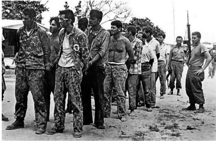
Figure 3: Captured Cuban Freedom Fighter from Miami after the failed invasion

The United States wanted to remove Castro from power more than ever after the defeat at the Bay of Pigs. The United States assigned staff to investigate what went awry at the Bay of Pigs and decided to take on a new approach. In 1962, the United States created Operation Mongoose. The plan would assist the counter-revolutionaries inside Cuba to topple the Communist regime. The United States tried to sabotage the Cuban government with arming rebels, assassination attempts, and propaganda. The United States also set up a blockade to destabilize the Cuban economy. In order to ensure the success of this plan for espionage, the C.I.A created Task Force W and created a large C.I.A. station in South Florida (Garcia).