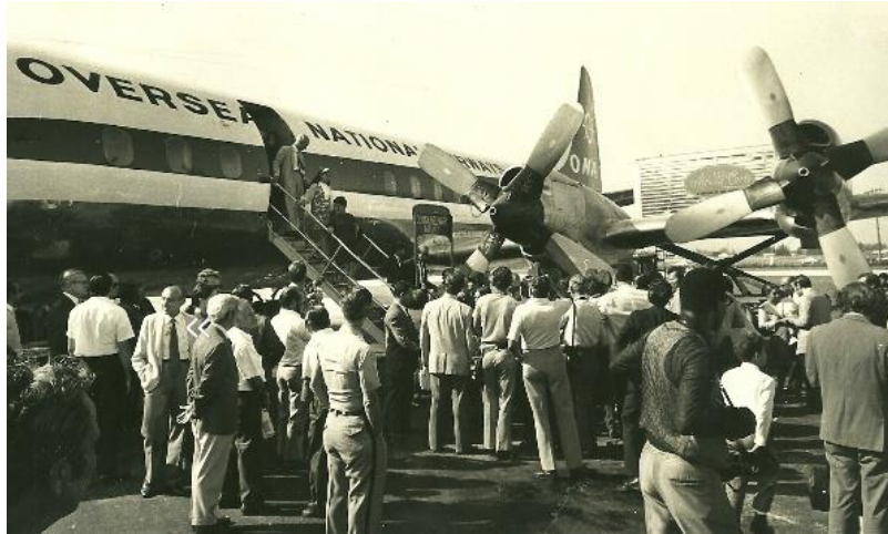
Figure 5: Photo illustrating Cubans leaving for Miami from a Cuban airport.

The Cuban Freedom Flights from 1965 to 1973 prompted the relocation of 265,000 Cubans and created an influx of immigrants into the United States.