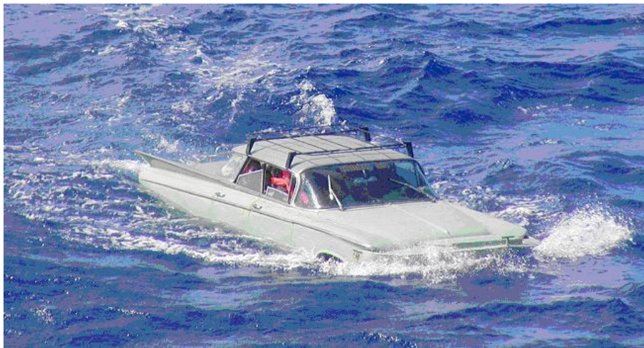
Figure 7: Cuban 1959 Buick raft.

F.Supp.2d 1242 (S.D. Fla. 2004). In Rodrigues , eleven Cubans were caught at sea trying to travel to the United States in a raft fashioned from a 1959 Buick on February 3, 2004. The Cuban immigrants were found twenty five miles south of Marathon, Florida in international waters. While onboard the Coast Guard vessel, the Cuban immigrants entered within twelve miles of the Florida coast on three separate occasions. On February 10, 2004 an Asylum Officer interviewed the eleven Cubans to evaluate if they showed a sufficient amount of fear in order to be granted asylum. Of the eleven immigrants, eight were sent back to Cuba and the other three were found to have shown a believable fear of persecution and were taken to Guantanamo Bay. Rodrigues argued to consider entry into United States waters sufficient for immigration purposes. The District Court held that entry into United States waters did not count as entry into the United States for immigration purposes.