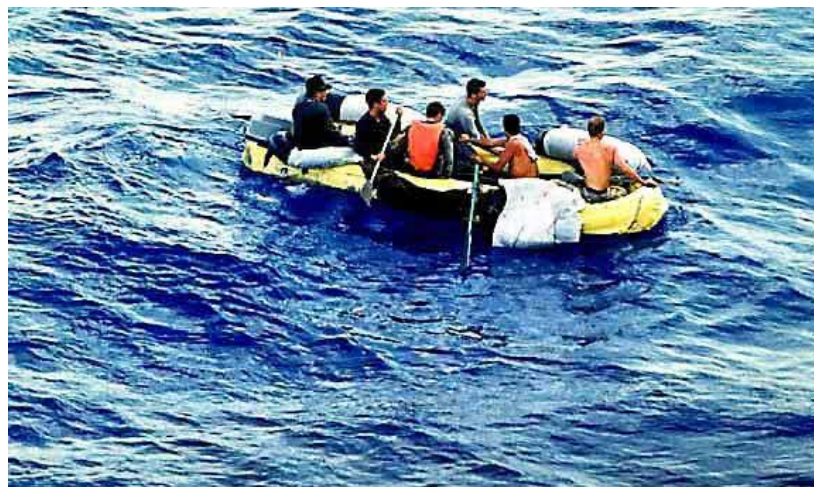
Figure 6: Balseros arriving in Miami.

The Act details other allowable interactions with Cuba. Citizens in the United States are allowed to send and receive mail from Cuba; as well as send food donations and medical supplies. Non-governmental organizations in the United States may provide assistance to those in Cuba to encourage a non-violent movement towards a democratic Cuba. United States citizens are also allowed to engage in telephonic communications with Cubans. However, vessels that have docked in a Cuban harbor may not dock at an American port within 180 days of leaving the Cuban port. Also, vessels cannot enter an American port if they are carrying any cargo or persons from Cuba (Wasem).