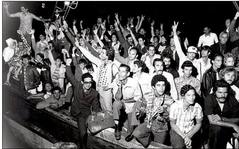
Figure 4: Photo illustrating refugees arriving in the US via the Mariel Boatlift. Printed in the New York Times.

“The Communist Party of Cuba stated clearly that Cuba wouldn’t oppose those who wanted to go to the United States, and they could do so directly and safely, in boats sent by their relatives to the ports of Mariel (García 218-219).”