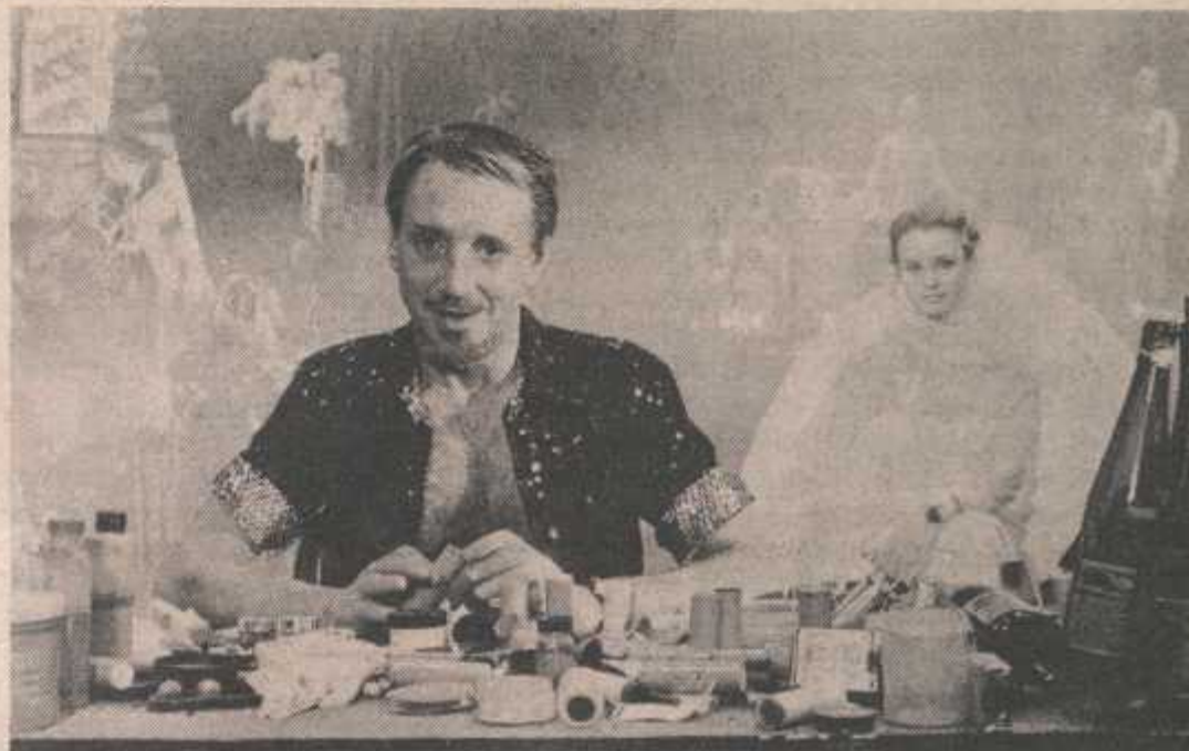
Roy Scheider in "All That Jazz"

hundreds. Fosse shows a great talent in editing, which prevails all through the film, to show how the group is cut down to size. With each shot, the cast is diminished. Director Gideon must put up with a script that doesn't deserve the great choreography. To show the audience how the jokes of the musicals script don't appeal to Gideon, Fosse uses a selective method on his soundtrack. As the script is being read, and everybody laughs, all we hear is the sound of the paper Gideon wrinkles, and his fist hitting the table in hidden anger. The shallowness of the script becomes obvious even though we never hear it. Film director Gideon faces the same problem most of today's filmmakers seem to suffer from. He is obsessed with his movie. Like Francis Ford Coppola with Apocalypse Now , Gideon can't let his film, the Stand-Up be released. He is constantly re-editing it. The jokes in his film seem to re-occur in a nightmarish effect all around Gideon. He does not know where his film ends and his life begins. All That Jazz is a probing of all the varied sides of Joe Gideon (Bob Fosse). The open-heart surgery, so vividly portrayed, represents the probing Fosse is trying to make into