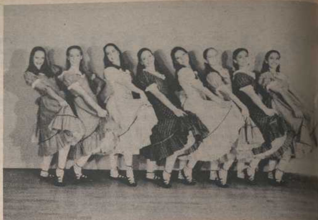
The Florida Ballet Guild