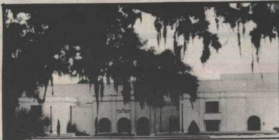
Enyart-Alumni Field House