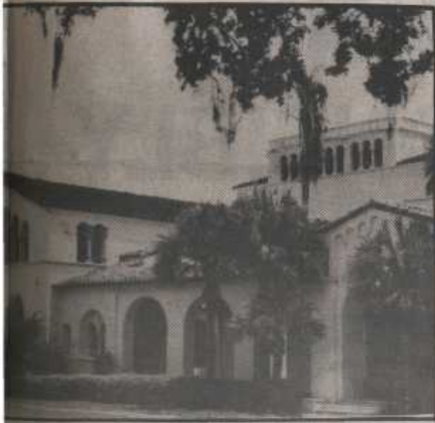
Annie Russell Theater