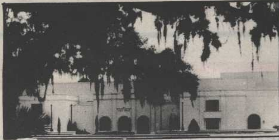
Enyart-Alumni Field House