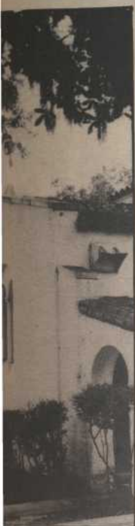
Center Spring Lake Virginia late tournament ration Alumni House