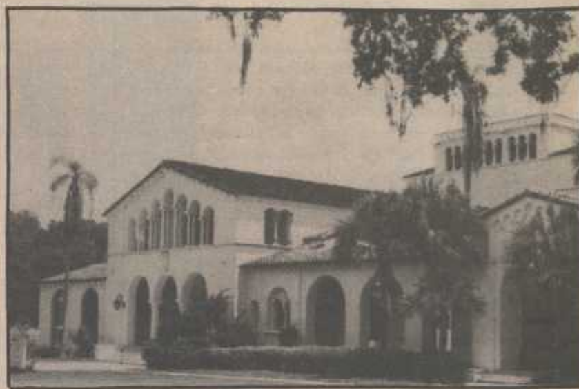
Annie Russell Theatre