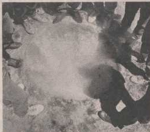
OFFICIAL SHOE OF THE CENTER FOR METEORITE RESEARCH.