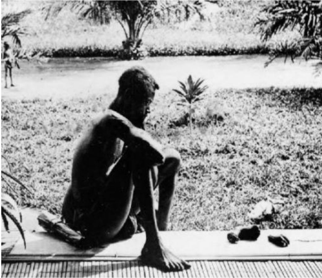
Figure 2 – Congolese Man Staring at Daughter's Mutilated Limbs