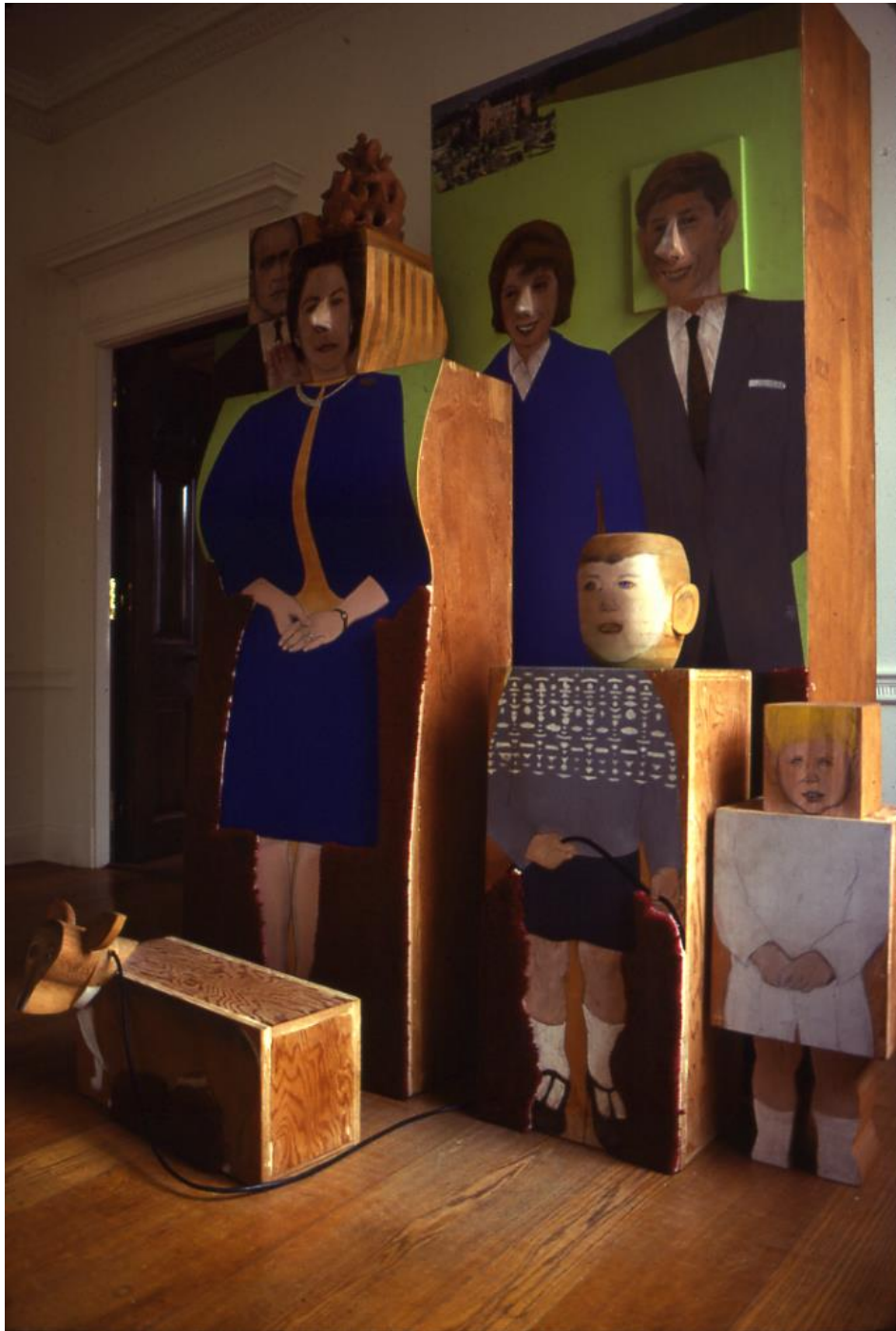
Figure 4 The Royal Family , 1967