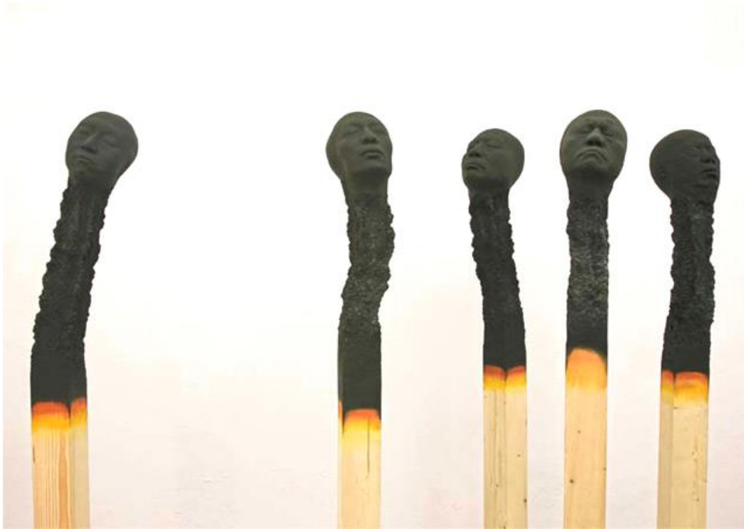
Figure 8 Image from Wolfgang Stiller's series Matchstickmen 55 Displayed March 8 th to May 11th 2013 at the Python Gallery in Zurich