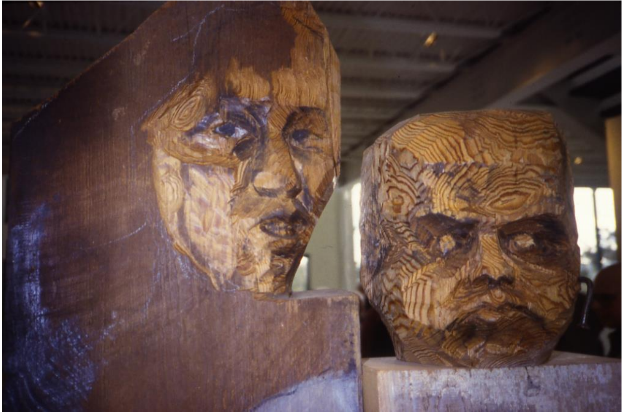
Figure 6 Detail of Woman with Child and Two Lambs , 1995 45