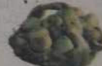
Viva Terra root basket of organic fruit, $125-$185.

• Viva Terra ( www.vivaterra.com ): Viva Terra (meaning "living earth") offers eco-sensitive, organic items, many of which are hand-crafted. There are products available for the home and garden, but also bath, dining room and kitchen, as well as food, jewelry and apparel. Our picks: the Root of the Earth bowls (made from discarded root balls, also available filled with organic fruit) ($35-$185), the Twig Flower Holders ($62-$119) and the Veggie Parchment Bowls (bowls made from sliced vegetables, $42-$119).