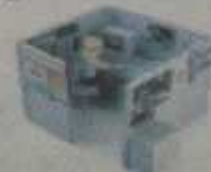
Culture play sets, $3.99-$12.99, from ThinkGeek.

• ThinkGeek ( www.thinkgeek.com ): According to the site, "ThinkGeek started as a way to serve a market that was passionate about technology." But this is much more than just cool electronics. ThinkGeek offers toys, T-shirts, gadgets, sci-fi, geeky (yes, coffee production), and home and office accessories. Our picks: culture play sets ($3.99-$12.99), the "I Love My Geeks" baby-doll tee ($17.99) and the Flat iPod LCD remote ($69).