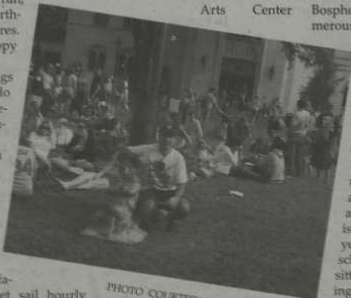
PHOTO COURTESY OF ROLLINS COLLEGE MUSEUM, the Charles Hosmer Morse Museum of American Art, and the Winter Park Historical Association &amp; Museum. Each museum offers its own unique collection of exhibits.

5. Spend a day visiting the local museums. In Winter Park, there are four museums: the Albin Polasek Museum and Sculpture Gardens, the Cornell Fine Arts Center