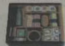
Melissa & Doug Stacks Set, a wooden version of the trendy trend, $25, from abcmouse.com .

• AbcMouse ( www.abcmouse.com ): The recently launched AbcMouse is the first of the month club of the baby world. The company offers gift series for children ages 0-5. Children can start four gifts a year, or one every three months. You can also buy items individually (including the Melissa and Doug Stacks Set, $25). Our pick: the Premium 100 series for newborns (Night Light Soother, Battery Plug, Rattle, Knack Knack soft blocks and the Musical Musical cube, $150).