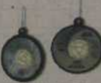
Record ornaments, $18 for three, from Uncommon Goods.

• Excitations ( excitations.com ): For the person who has every THING, Excitations gives experiences — from skydiving to spa weekends. Gift packages are not cheap, and they are only available in the New York, D.C., Chicago and Philadelphia areas (though they would make a good gift for anyone traveling to those cities). Our picks: the Lighthouse tour of the Chesapeake Bay ($240) and the Extreme Stock Car Driving Experience (from $415).