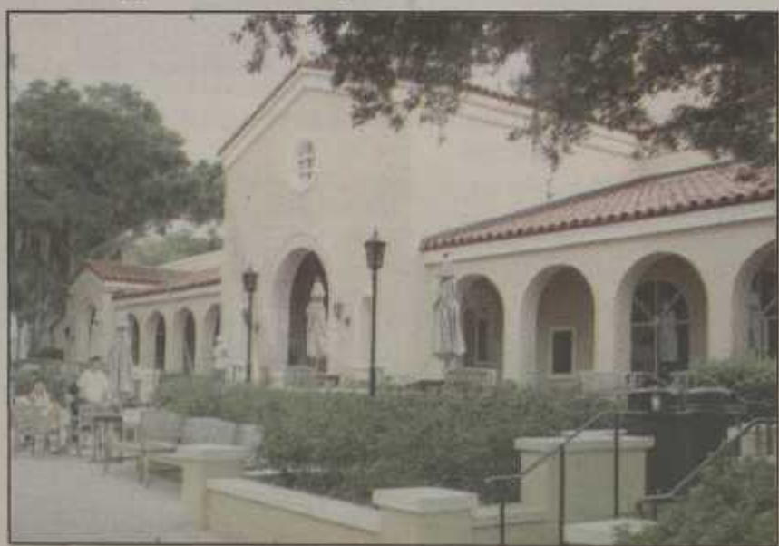
Cornell Campus Center

Also, the Mills Building houses TJ's Student Resource Center, where students can sign up for individual tutoring sessions and writing center appointments. Think you are pretty hardcore and don't need a tutor? Just wait until your first college exam, and you will be surprised how much a one hour appointment will help!