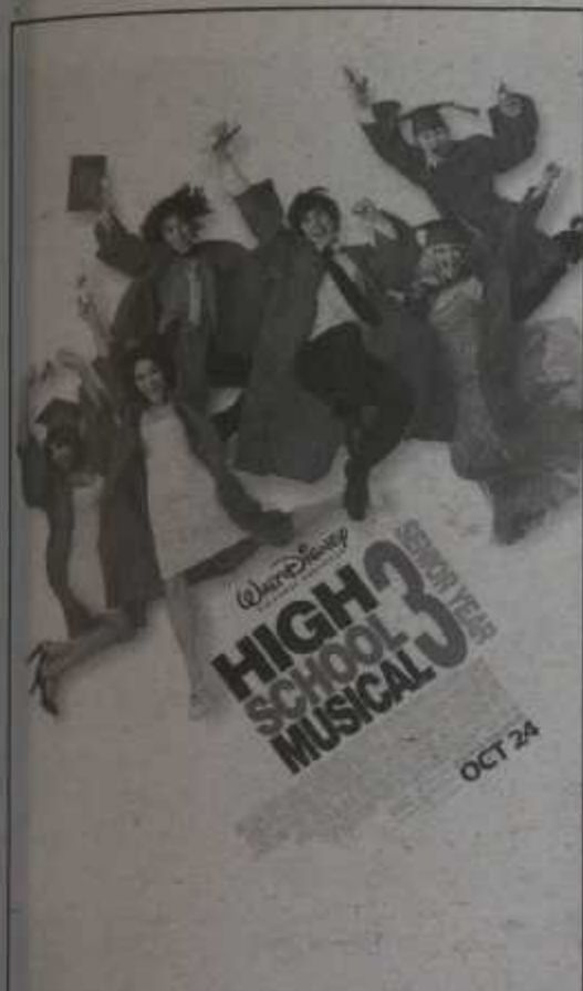
Walt Disney Pictures

Disney's "High School Musical 3: Senior Year" has spent yet another week as the number one movie in America. The movie is just like that annoying and overly-bubbly person in your class—all that cheerfulness makes you want to gag, but at the same time the energy is infectious. The success of the third installment continues to leave many shocked and slightly disgusted, but I'm going to suggest that Rollins students watch it anyway.