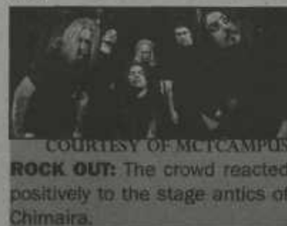
ROCK OUT: The crowd reacted positively to the stage antics of Chimaira.

Following this, the black-clad onlookers left the outside Ernie Ball Stage and got in a line that stretched around the building. Chimaira came out first. As the lights dimmed, the crowd erupted and the smell of marijuana filled the arena. They closed with fan favorite "Pure Hatred" and the crowd screamed out, "I hate, everyone!"