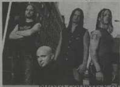
DOWN WITH THE SICKNESS: Disturbed started Music as a Weapon to reintroduce metal and hardcore back to the populous. They stunned their audience with an amazing set of their neu-metal music.

Finally, the moment everyone in the crowd had been waiting for: Disturbed ... and they did not disappoint. They sounded just as good, if not better, than they do on their CDs. They pulled the audience into the show to the point that everyone in the crowd was singing along with Draiman. The encore consisted of their songs "Indestructible" and their hit "Down with the Sickness."