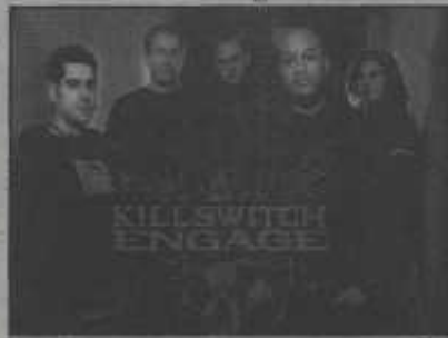
CHUCKLES: The fast paced pseudo metal band took the crowd by storm, warming them up one last time for Disturbed.

Lacuna Coil gave a good performance; however, it seemed out of place at this concert. Their vocal mics were not loud enough, as the instrumental backup drowned out Irish singers Cristina Scabbia and Andrea Ferro. Unlike most of the other bands, the singing aspect of their act is vital to the enjoyment of their show. As soon as Lacuna Coil left the stage, chants of "Killswitch!" rang out from the floor and people began pushing in anticipation. Howard Jones' screaming and stage presence enveloped the whole crowd as mosh pits popped up all over the floor of the stadium. They finished their great show with a curtain call amidst shouts of "One more song!"