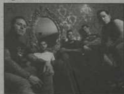
BURIED ALIVE: Bury Your Dead electrify the crowd as one of the opening acts for the Music as a Weapon tour.

Bury Your Dead's heavy guitar and lyrical screaming coupled with their great stage presence made them one of the most memorable bands at the show. By the end of their set, they had inspired the whole crowd to chant, "Bury your f-ing dead!"