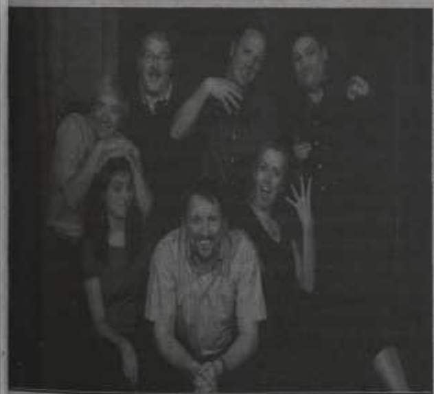
FOURPLAY FRIENDS: The cast of Fourplay having fun while working on the show.

Fridays and Saturdays at 7:30 p.m., Saturday and Sunday matinees at 2:00 p.m., and Thursday matinees at 2:00 p.m. on October 8 and 15. Rollins students can reserve tickets at half price if they call the Winter Park Playhouse three hours before the show.