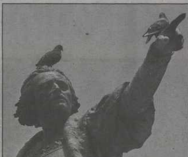
DISCOVERY: A statue of Christopher Columbus stands in memory of his landing on Plymouth Rock.

4. Indians! America's first inhabitants do not remember Columbus very fondly. The term "Indians" is one of the reasons why. Thinking he had arrived in the Indies, Columbus originated the famous error, which continues even into the present. Wherever you go, make an effort to mislabel whatever you find.