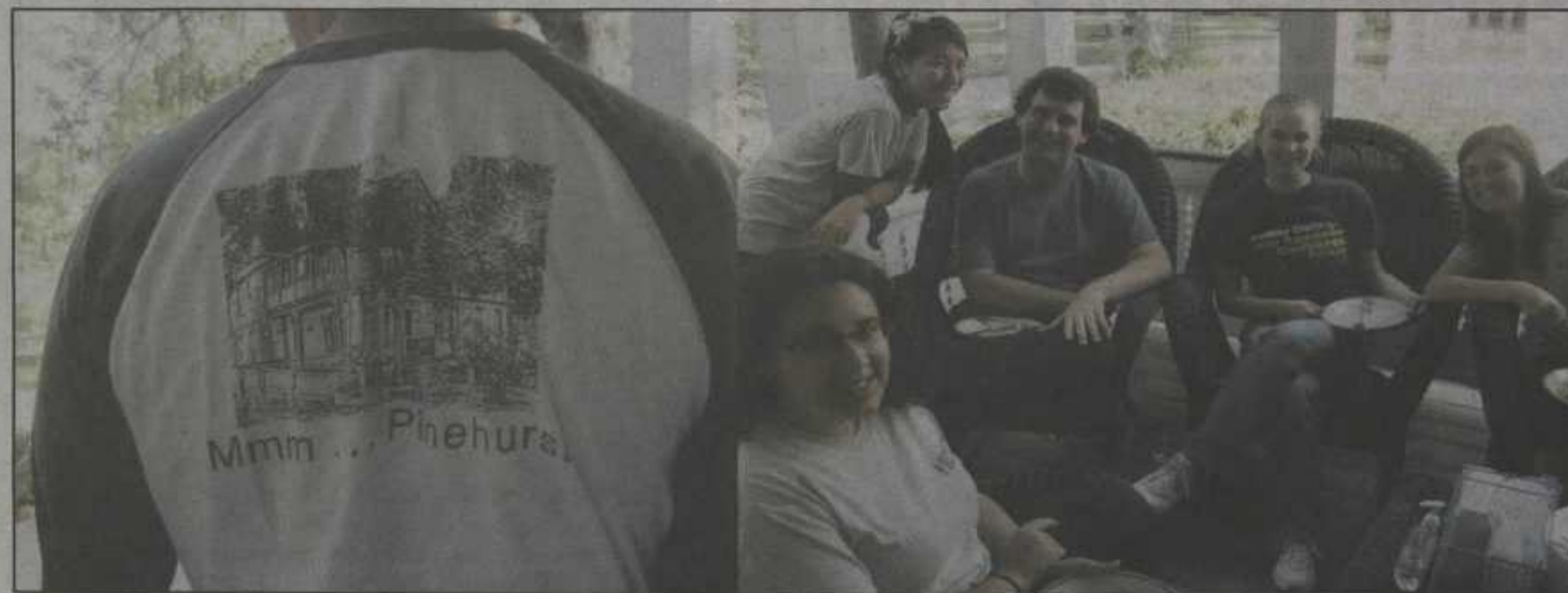
HAPPY PLATES: Some students enjoy the delicious pancakes on the Pinehurst front porch.