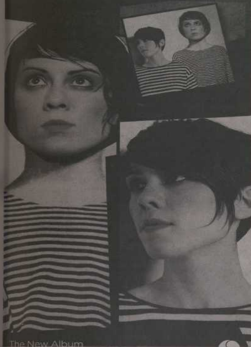
The New Album