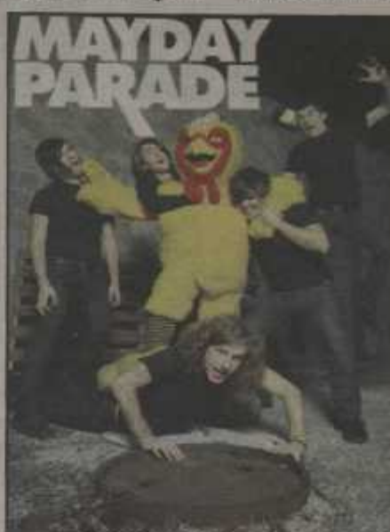
CLUCKING AROUND: Mayday Parade poses with the infamous chicken suit.

However, the thing that sets Mayday Parade aside more than anything is their lyrics.