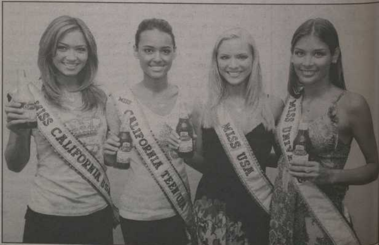
BEAUTY QUEEN SMILES: Prejean (left) hams it up for the camera after her win and before the sextape scandal.

Here's hoping we don't have to endure her much longer.