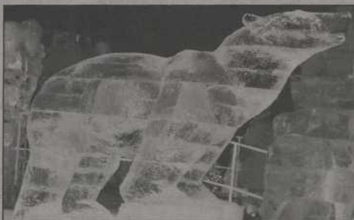
GREG GOLDEN / the sandspur

Your next encounter includes a carousel made entirely from ice. You then enter the hall of life-size ornaments, again made from ice, before reaching