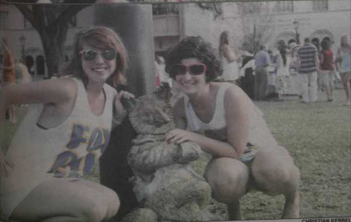
Schmoozin' and Smiling: Several students take turns posing and taking pictures with the famed fox during the Fox Day BBQ.