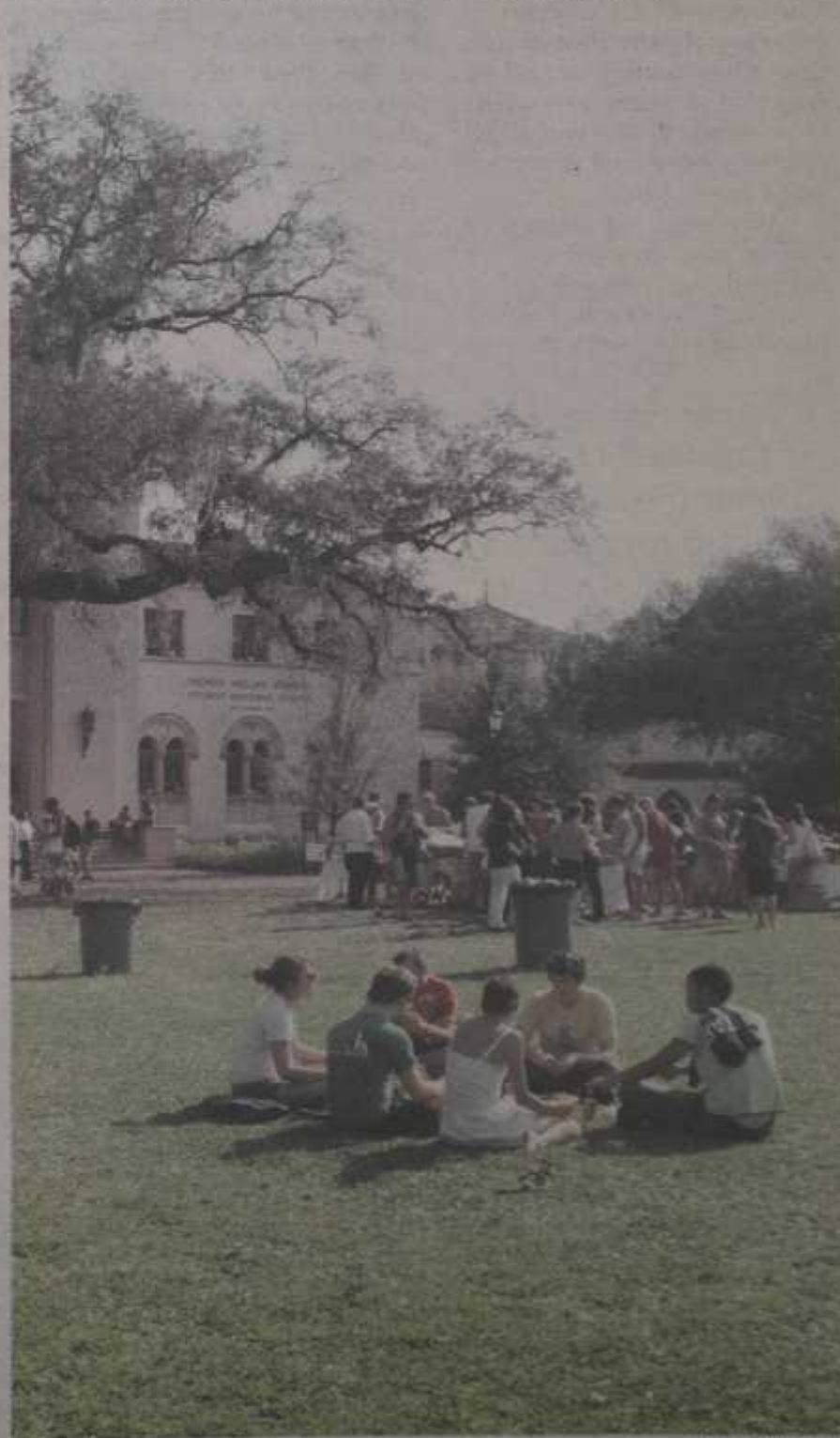
In the Mush Pot: Students, faculty, staff, and family members gathered together in the sun on Mills Lawn at the end of their day off from classes to enjoy a delicious fully catered BBQ dinner.