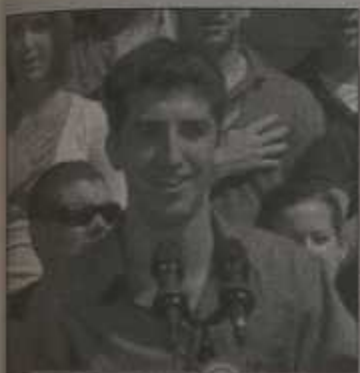
Yoni Binstock Columnist

Yoni's take on the political environment of the nation and the world.