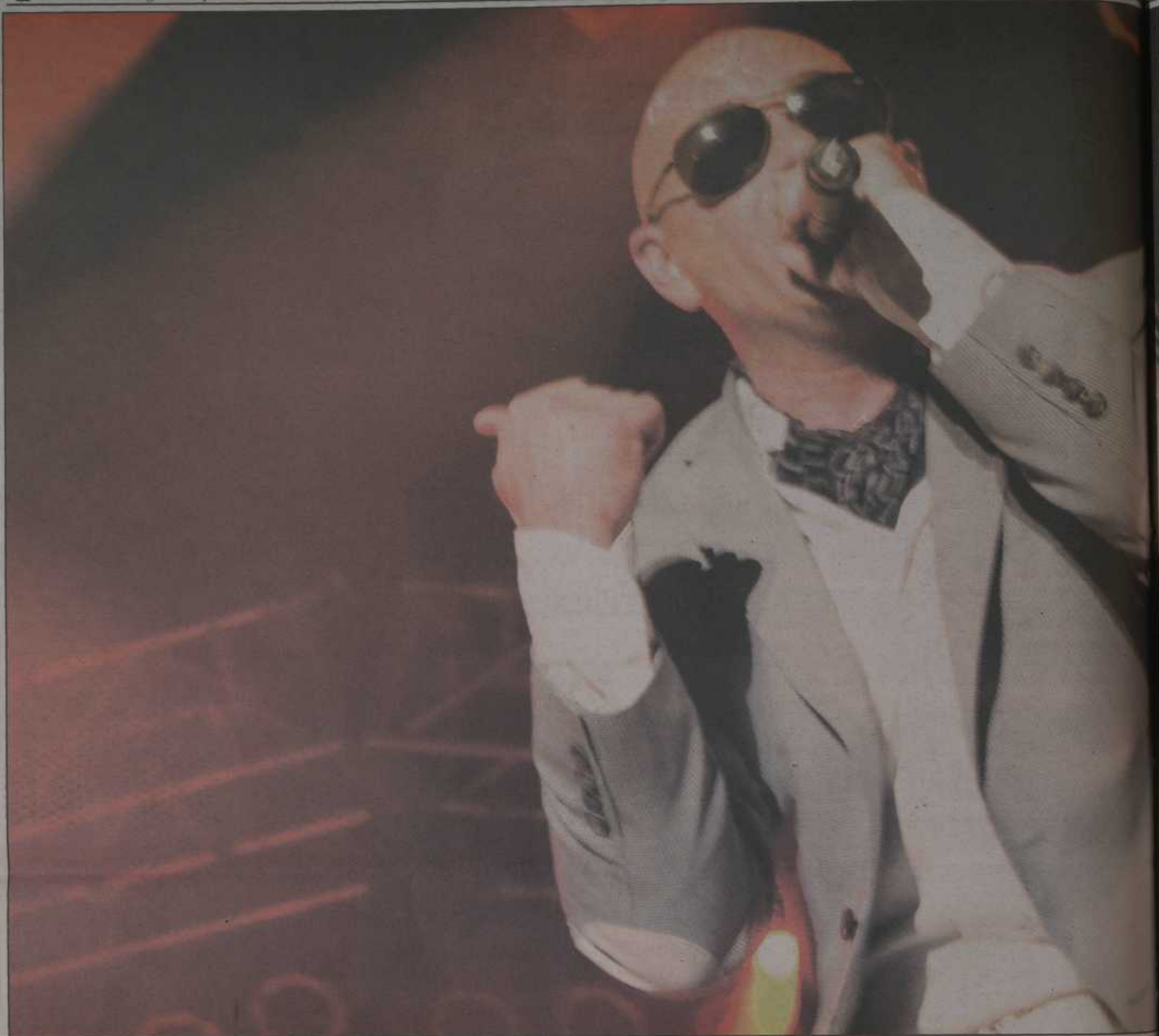
PUMPING THE MUSIC: (above) Pitbull performed "Hotel Room Service" and "Hey Baby" at his concert during the Mardi Gras celebration on Feb. 26. Various artists will be performing at Universal Studios select nights through April 23.