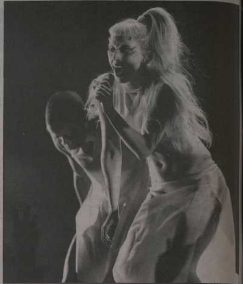
GAGA OH LA LA: Lady Gaga's new song has offended various ethnic groups with its somewhat offensive racial references. Many people have reacted badly to the single's release, but the hype has been blown out of proportion and should quickly die down.

"Born This Way" is a solid pop song, and that is what Lady Gaga is known for being: a pop star. She is only as great as her music shows her to be; no more, no less. I believe a majority of the backlash on this song is a result of people getting too hyped up for this new single, much of this due to not only the music industry but to Gaga herself. The caliber of this single did not meet many people's expectations. But... it is only one single. With the release of the track's music video and the full album coming out May 23, we still have much more time before we can lay final judgment on this fair Lady.