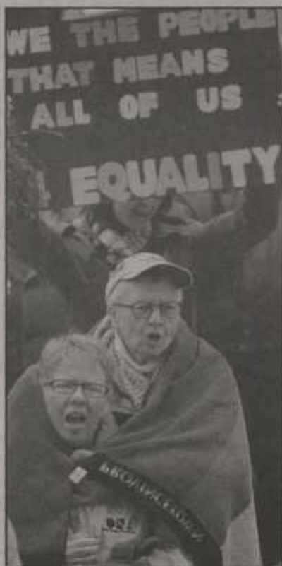
EQUALITY BEFORE THE LAW: LGBT couples around the country have put on rallies and protests to alert people of the discrepancies between the rights of homosexual couples and heterosexual ones.

It is not about the title. It is about the government legally giving straight couples the right to adopt a child and put both names of the parents on the