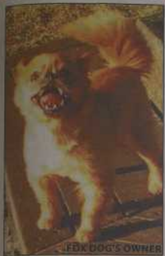
REAL-LIFE FOX DAY FOX FOUND! PAGE 5