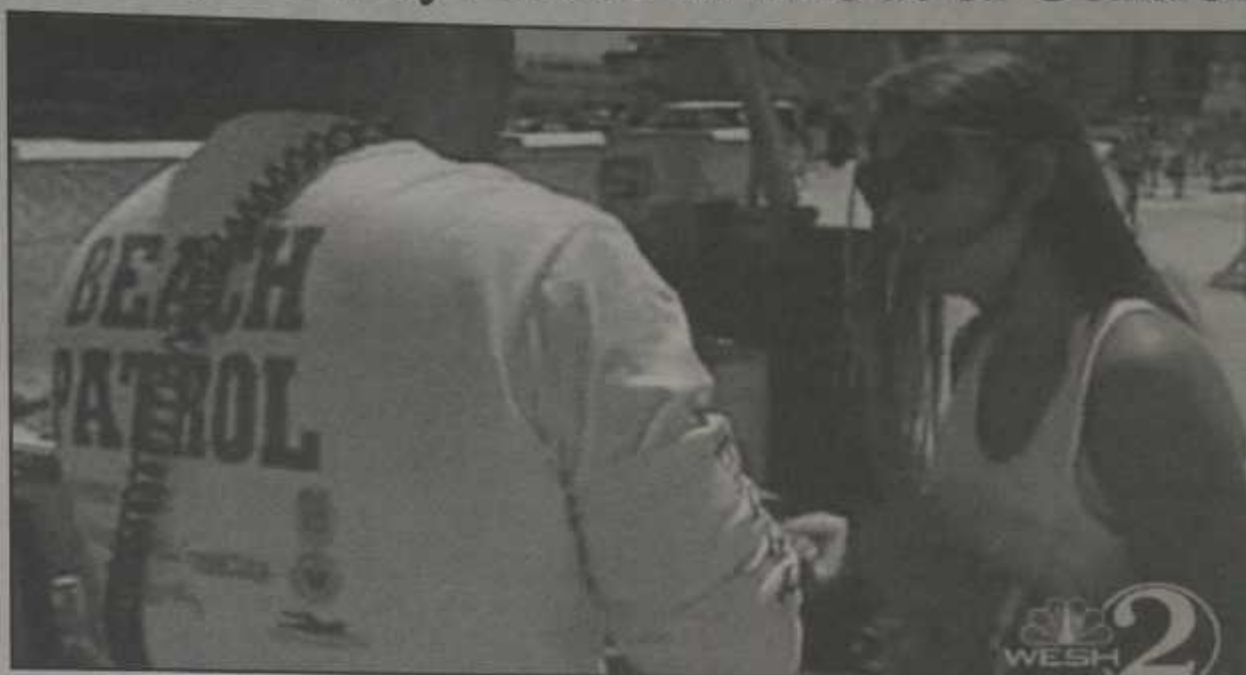
DAZED AND CONFUSED: Local news reports say that the "attitude" of Rollins students caused a problem for beach police, even though only somewhere from 15 to 20 students actually received citations out of the hundreds who were there.

While it is legal to air the faces of adults in public places, one has to wonder if the line between reporting the news and exploitative journalism has been crossed. For example, is it