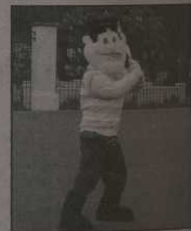
TOMMY STRIKES AGAIN: Tommy the Tar often enjoys participating in the sports he represents.

"Cough." The loving attention I get from the Rollins community and that I must destroy my archenemy: The Fox. I have even heard rumors of people