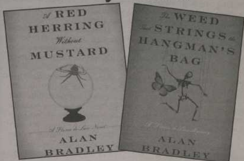
OF HERRINGS AND HANGMEN: Alan Bradley's most recent novel A Red Herring Without Mustard proves to be just as entertaining as the other two books in the series.

ops his characters beyond the flat pages of a book so effectively that the reader can paint perfect mental images of Flavia's town, Bishop's Lacey, and its citizenry. Seventy-year-old Bradley perfectly captures the thoughts of an 11-year-old girl.