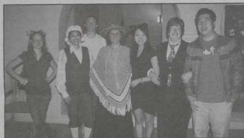
CELEBRATION: The German studies program took part in Karneval, a festival similar to Mardi Gras, with food and fun. Students celebrated in costumes ranging from soccer players to cats and Disney princesses to pirates.