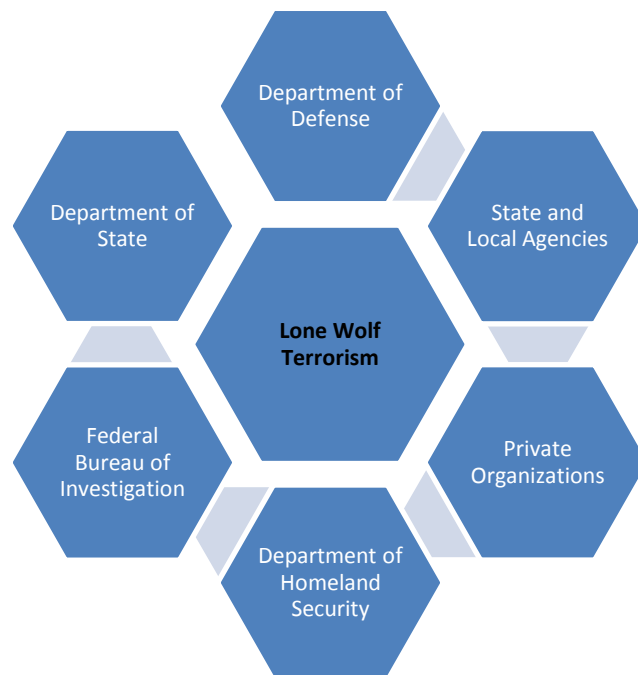
Figure 3: Direct Actors in Relationship to Lone Wolf Terrorism

agencies and various other actors that are directly and indirectly affected by a terrorist threat and/or attack. Also, private organizations are included. Private organizations include non-profits like the Red Cross and Salvation Army, private contractors and businesses, hospitals and others.