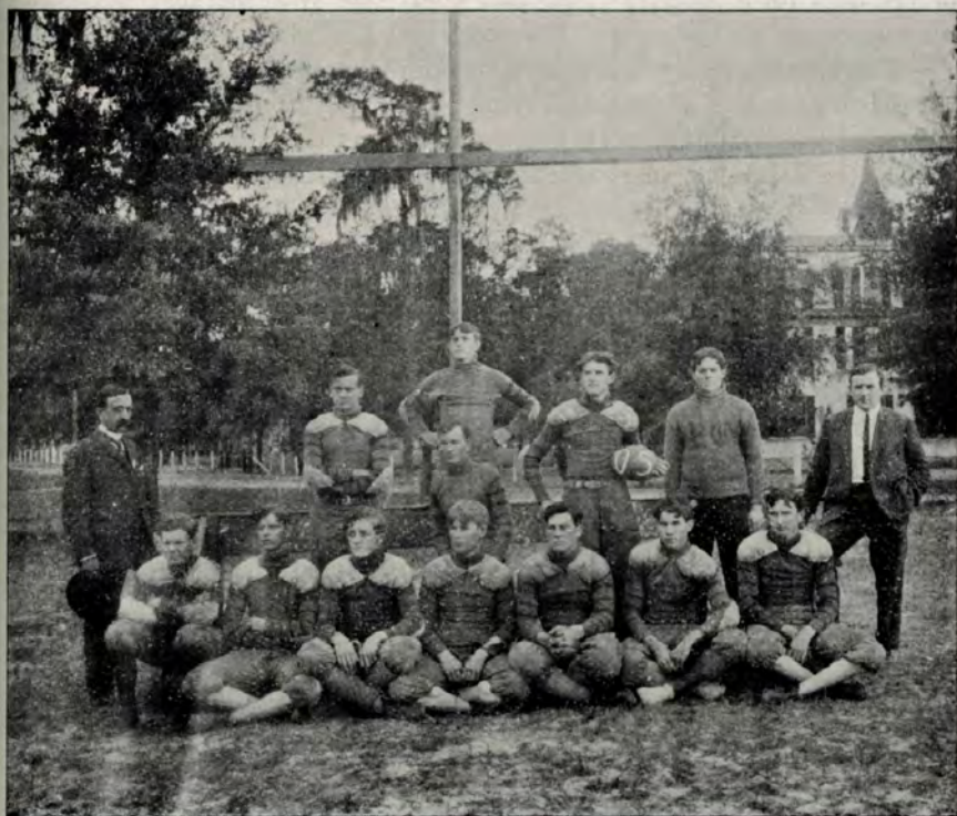
ROLLINS BASEBALL TEAM, 1905.