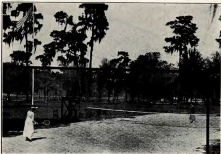
TENNIS IS HERE