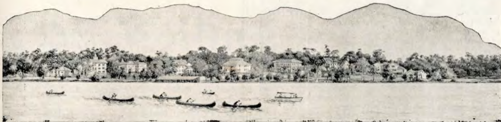
COLLEGE CAMPUS FROM LAKE VIRGINIA