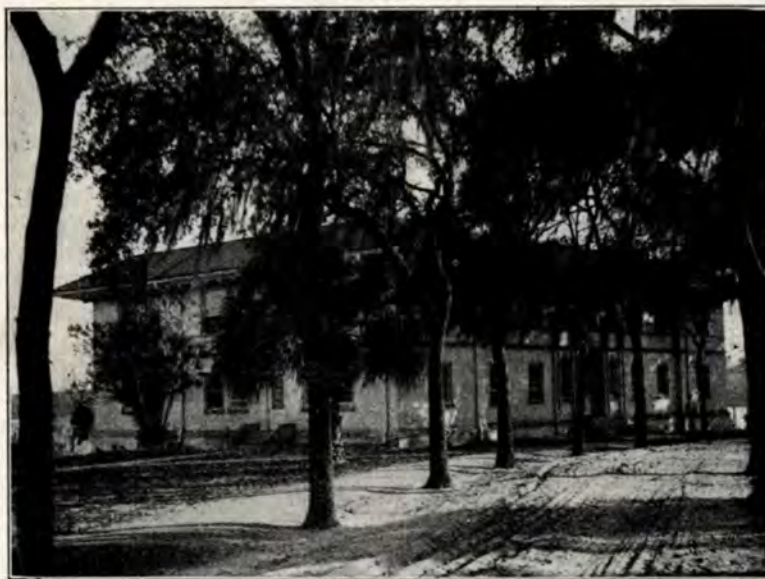
CHASE HALL, WHERE ALL THE BOYS WILL LIVE THIS YEAR