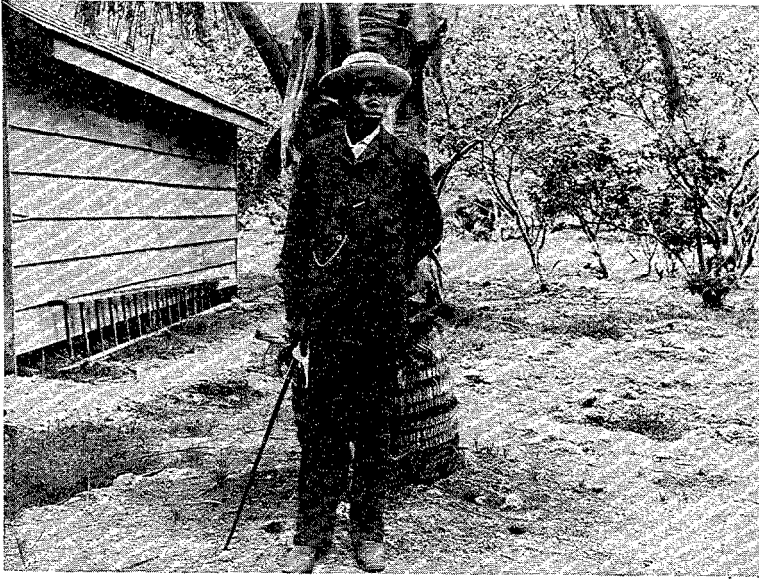
Coconut Grove Bahamian in Sunday best, late nineteenth century.

terns of “livelihood migration” by the early decades of the twentieth century. 9