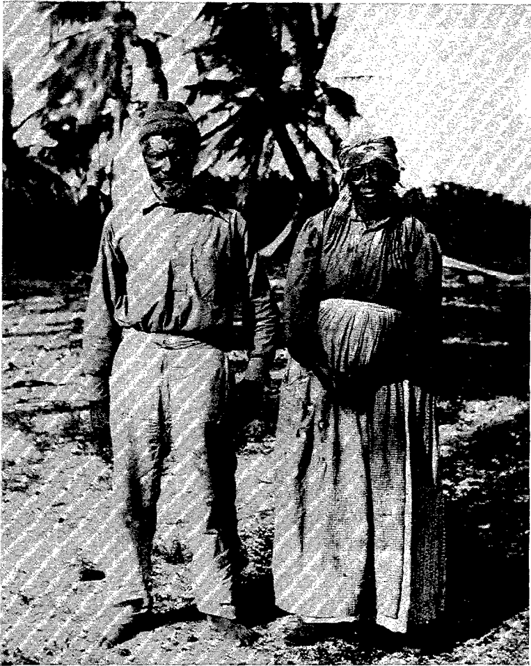
The "Boss" and the "Cook," Plantation Key, 1895.