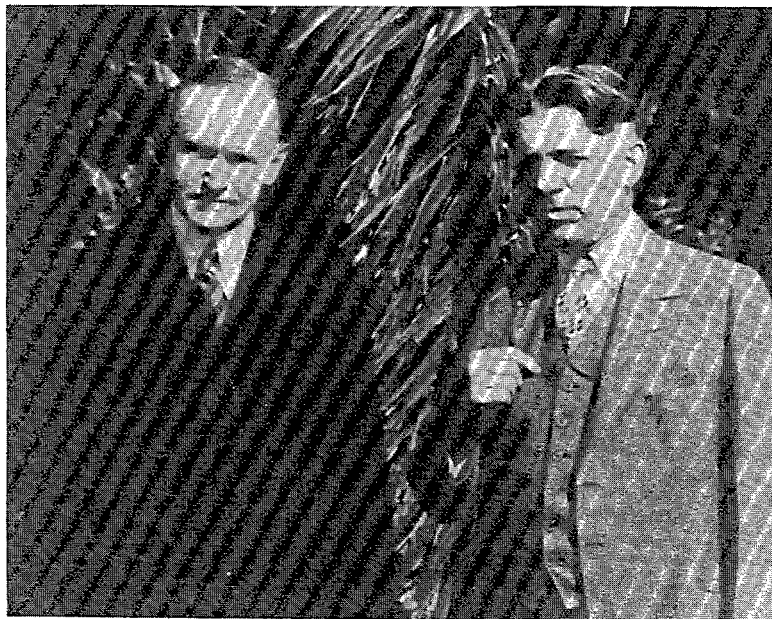
Former President Calvin Coolidge visiting Howey in Florida during the early 1930s.

it was “time to clean out the sore spots” in the party and replace them with “men who command the respect of Democrat and Republican alike.” 100 In an effort to create party unity John F. Harris of Palm Beach, a close friend of J. Leonard Replogle, the national committeeman before Skipper, was chosen to replace Skipper. 101 This left the party closely tied to northern Republicans and minimized Howey’s efforts to broaden the base of the party by appealing to southern Democrats.