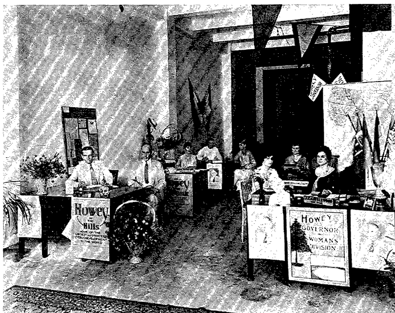
Republican gubernatorial headquarters in Miami, 1928.

that his opponent, Doyle Carlton, had received enormous fees in the sale of Tampa city bonds while serving as its attorney. 67 Howey also asserted that Carlton has mismanaged hurricane relief funds in 1928, and had gained an unwarranted exemption from service in World War I. 68 Howey wrote his own version of the Republican platform which promised Floridians “a conservative and efficient business administration” and concluded: “Howey built groves, Groves built towns, Let’s elect Howey, On these grounds.” 69