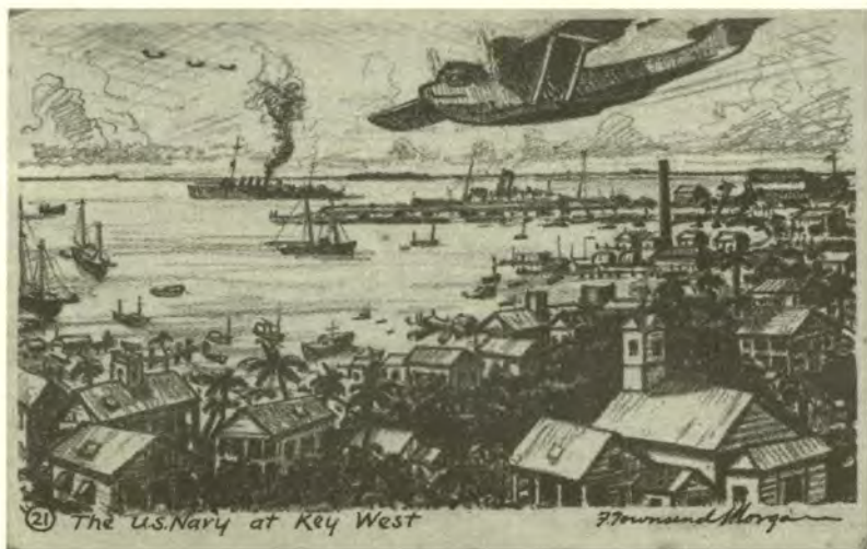
Figure 3. The U.S. Navy at Key West, 1940. This postcard by F. Townsend Morgan captures the island's busy harbor on the eve of war. Morgan first arrived in Key West as a hired artist for the Works Progress Administration. He remained on the island until 1949.

The merchant traffic that passed through Key West was protected