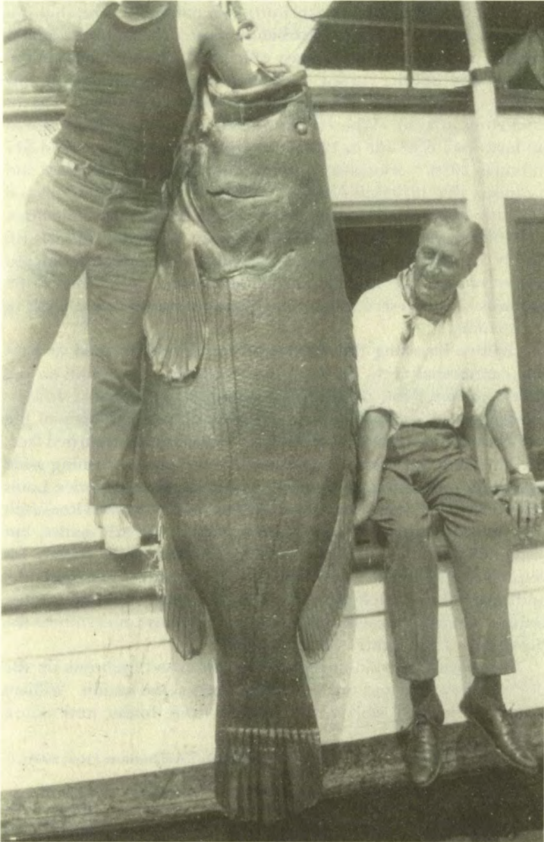
Figure 2. Franklin D. Roosevelt in Florida, 1926. Franklin Delano Roosevelt helped reel in this 500-pound jewfish while fishing in the Florida Keys on March 21, 1926.