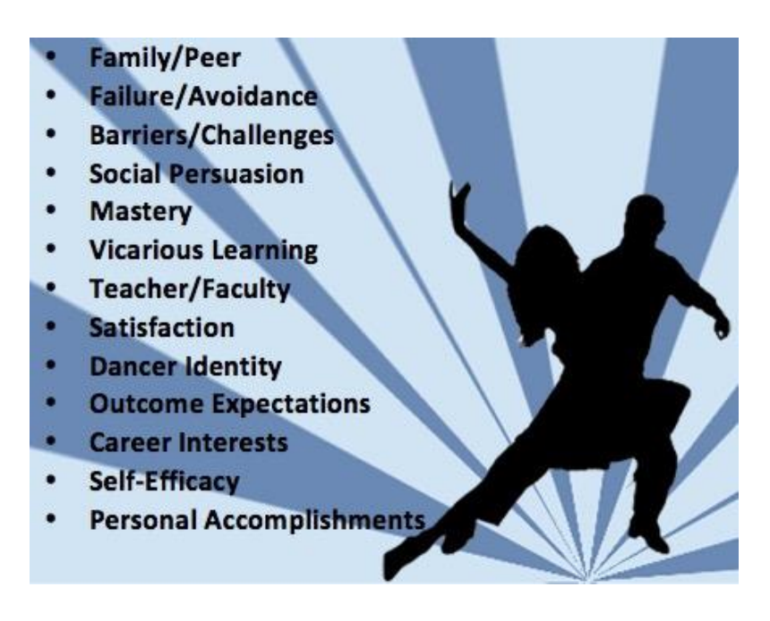
Figure 1. Tenets of social cognitive career theory for dancers.

of career performance and satisfaction. Figure 1 illustrates the building blocks, tenets, and influences of career identity for dance students in relation to SCCT.