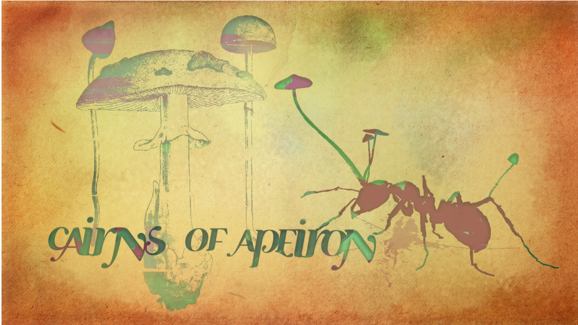
Figure 2: Title Still for Cairns of Apeiron made in Photoshop