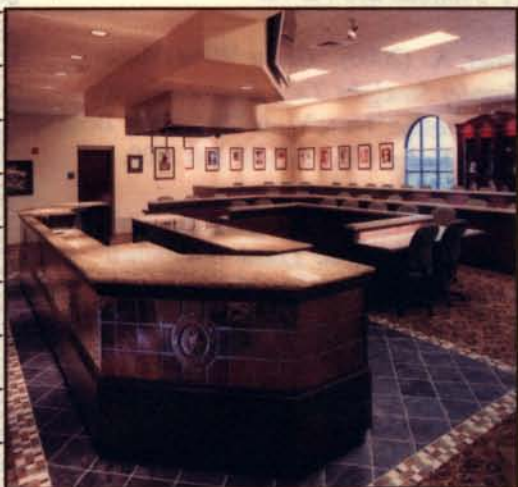
The Anheuser-Busch Wine and Beer Lab

"There is a certain ineffable tinge of joy and anticipation that we feel in our hearts when we hear the unmistakable 'pop' of a wine bottle as it is opened. That magical sound uncorks a wave of delicious sensations and memories and heralds new ones to come. For wine is a treasure to be enjoyed in good company. Each bottle is a celebration — of the bounty of the harvest, the fruit of one's labors, of life itself. When you hear that marvelous little noise, the cares of the day gently ebb away. Each time I hear that sound, I want to dive into the moment and draw it out, savoring each delightful sense."