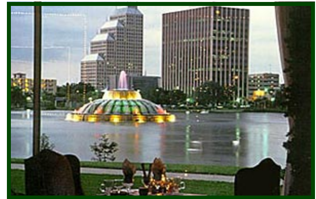
The panoramic view of Lake Eola and Orlando city skyline from the dining room at Lee's Lakeside.