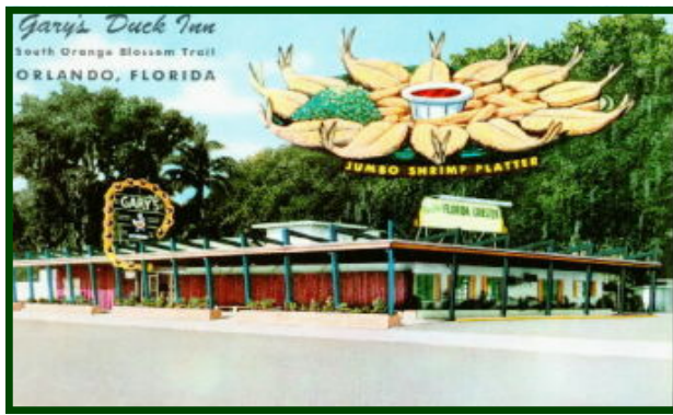
A postcard depicting Gary's Duck Inn.