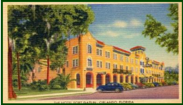
A postcard depicting the Hotel Fort Gatlin, circa 1950.

In the mid-1920s, Orlando's building boom gave rise to the Hotel Fort Gatlin on Orange Avenue where guests could relax and enjoy a "Full Course Golden Fried Chicken Dinner." The dining room served fresh Florida fruits and vegetables and meats of the highest quality, prepared by well-trained chefs. The building was bought and subsequently demolished in 1965 by the Orlando Sentinel newspaper which chose to expand its operations on the site.