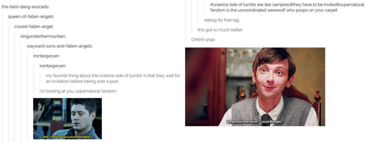
Figure 4: Further example of SuperWhoLock fans embracing stereotypes

you, science side of Tumblr.” This is used in the interaction shown in Figure 4 as a way to criticize the Supernatural Fandom.