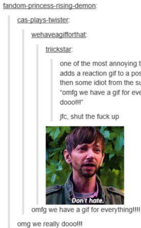
Figure 3: Example of In-Group Interaction with Out-Group

The first Supernatural fan has chosen to engage directly with the criticism through stereotypical fandom activity, but his choice of message is generally taken to mean “don’t get mad if it doesn’t hurt you.” The other two, in embracing the stereotype in the complaint down to exact words, are using the criticism as a way to say “yes, but we do actually have a GIF for everything, so we’re justified.” Their dig at the criticism embraces the criticized behavior as part of what makes the fandom special.