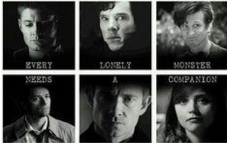
Figure 6: SuperWhoLock crossover values example

Though on the surface, the shows' views on violence seem divergent, there is an underlying similarity that might also appeal across fandom lines.