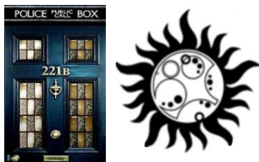
Figure 2: Sherlock/Doctor Who Icon, Supernatural/Doctor Who Icon

Icons are also a common identifier. In those Tumblr blogs that were not originally created as fan blogs, icons are often used to show fandom affiliation. Some symbols used as a visual indication of portions of the SuperWhoLock fandom can be seen in Figure 1 (above), and include: the door or address plate of 221B Baker Street or the main character’s silhouette for Sherlock , a flaming pentagram (a tattoo the main characters had which was important to the plot in an early season) for Supernatural , and either the TARDIS or Circular Gallifreyan (the language of the Doctor’s home planet). A common way of showing SuperWhoLock fandom is to merge these symbols in some way (e.g. Figure 2). Those which most often appeared were Circular Gallifreyan replacing the pentagram portion of the Supernatural tattoo symbol, or a representation of the TARDIS with the doors for 221B Baker Street.