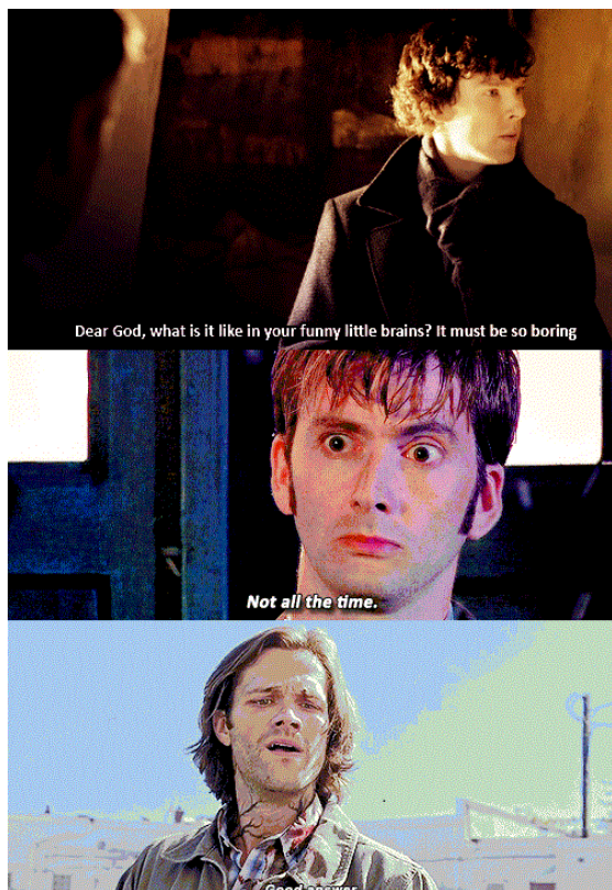
Figure 5: Fan work: SuperWhoLock crossover GIF series

The unique practice of the SuperWhoLock fandom is the creation of crossover images and GIFs. These could be thought of as a type of fan art, but it is distinct from the type of fan art common to most fan groups on Tumblr. These SuperWhoLock specific crossover images involve existing scenes and dialogue from the individual shows, put together in such a way as to tell a crossover story. Some are slightly altered, some entirely rewritten, but many are kept with the same dialogue as in the original scene (e.g. Figure 5).