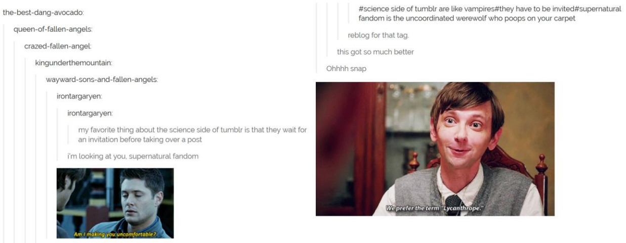
Figure 4: Further example of SuperWhoLock fans embracing stereotypes

you, science side of Tumblr.” This is used in the interaction shown in Figure 4 as a way to criticize the Supernatural Fandom.